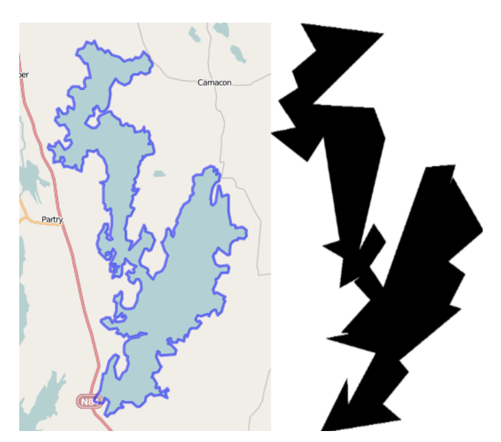
FIGURE 3. An example of the generalisation, by simplification, of a polygon from OpenStreetMap. The original polygon is on the left while the simplified polygon is on the right

from a research collaboration point of view is that researchers using proprietary computing environments have never found issues or problems with our use of an open source approach. Our software choices such as PostGIS, GDAL, uDIG (User Friendly Desktop and Internet GIS), etc means that we can consume spatial data and services from other computing environments easily. Alternatively we can exchange spatial data and services in an interoperable fashion meaning that software choice is encapsulated away from those outside our own research group. We close with remarks from Steiniger and Bocher (2009) who closes his paper with the statement that "while open source software may not be suited for everyone if the price tag argument is set aside. But it is the best choice for research in GIS".